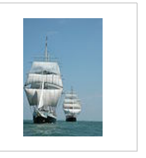
in the Sound of Mull Lord Nelson front,