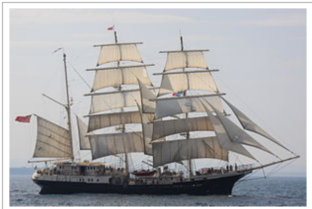
STS Tenacious at the starting line for the last leg of the STI Historical Seas Festival 2010 from Instanbul to Lavrion.

■ Tenacious (http://www.jst.org.uk/tenacious.aspx) — official page on the Jubilee Sailing Trust website